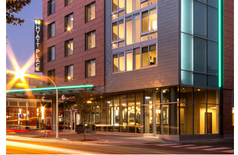
Conference Hotel: Hyatt Place Chicago South 5225 S Harper Ave

Distance from O'Hare: About 26 miles. Please allow an hour by car. Distance from Midway: About 15 miles. Please allow 40 minutes.