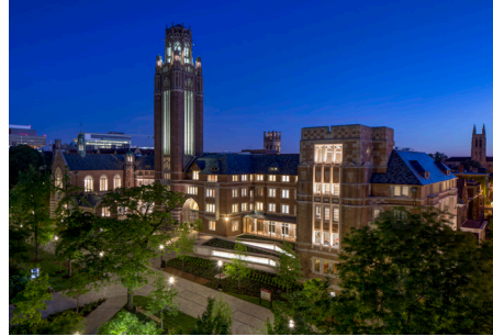
Day 2 Saturday September 12: Saieh Hall for Economics 5757 S. University Ave